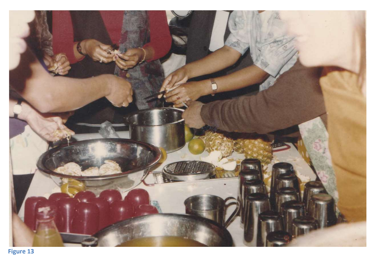
Food Processing indoor household production system in Nagaland