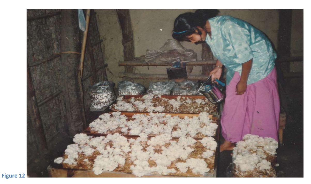
Mushroom production indoor household production system in Manipur.