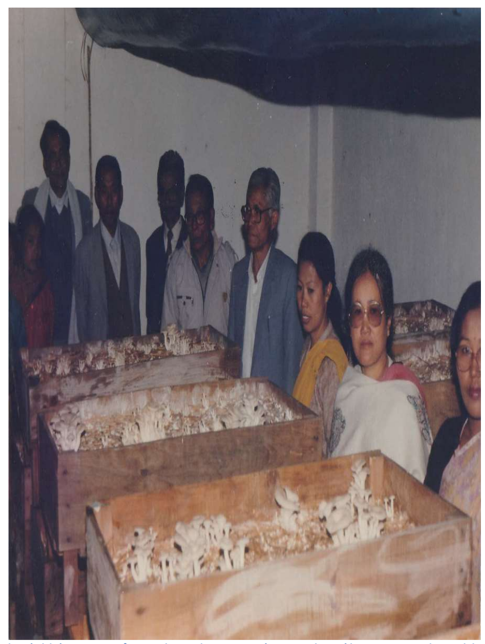
Figure 3 Educational visit by Women farmers in Manipur For Mushroom oriented income generation activity,1995