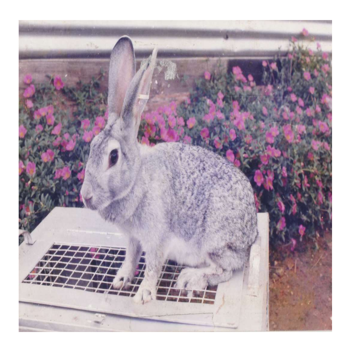
Figure 4 Rabbit farming has become quite popular in many places of India like Himachal, Uttarakhand, North east and southern states as there is readyu market with high profitability and less mortality due to disease and pests.

Figure 5 Due to scarcity of good quality water and Central Government funded subsidy for popularization Drip system of irrigation has become quite popular in high value and organized market of fruits and vegetables. Here a Banana plantation is seen from Karnataka near Bangalore where farmers with larger land holding have diversified their agriculture to