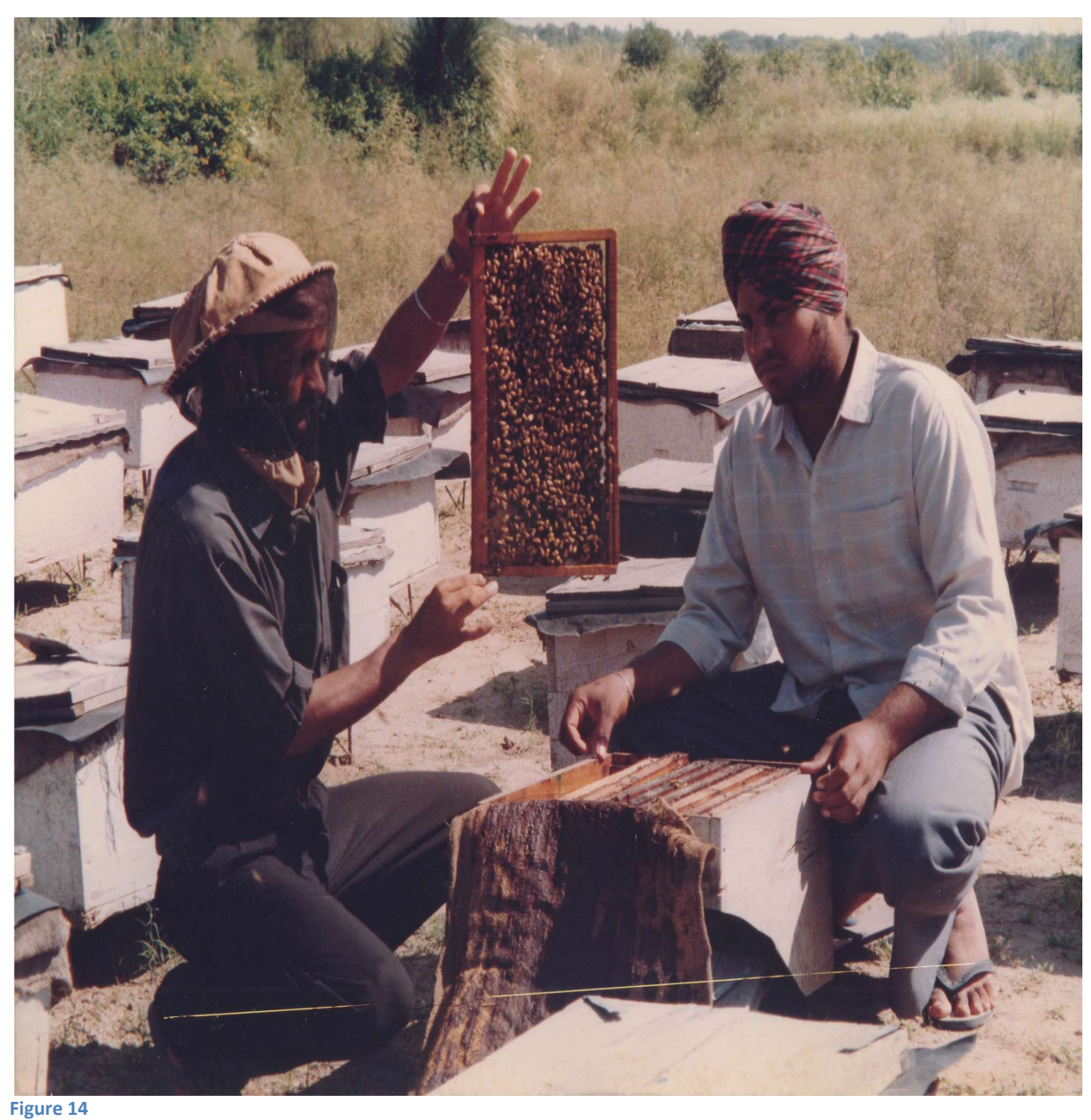
BEE KEEPING IN RAIPUR KHAD WATERSHED UNDER NWDPRA PROGRAMME.