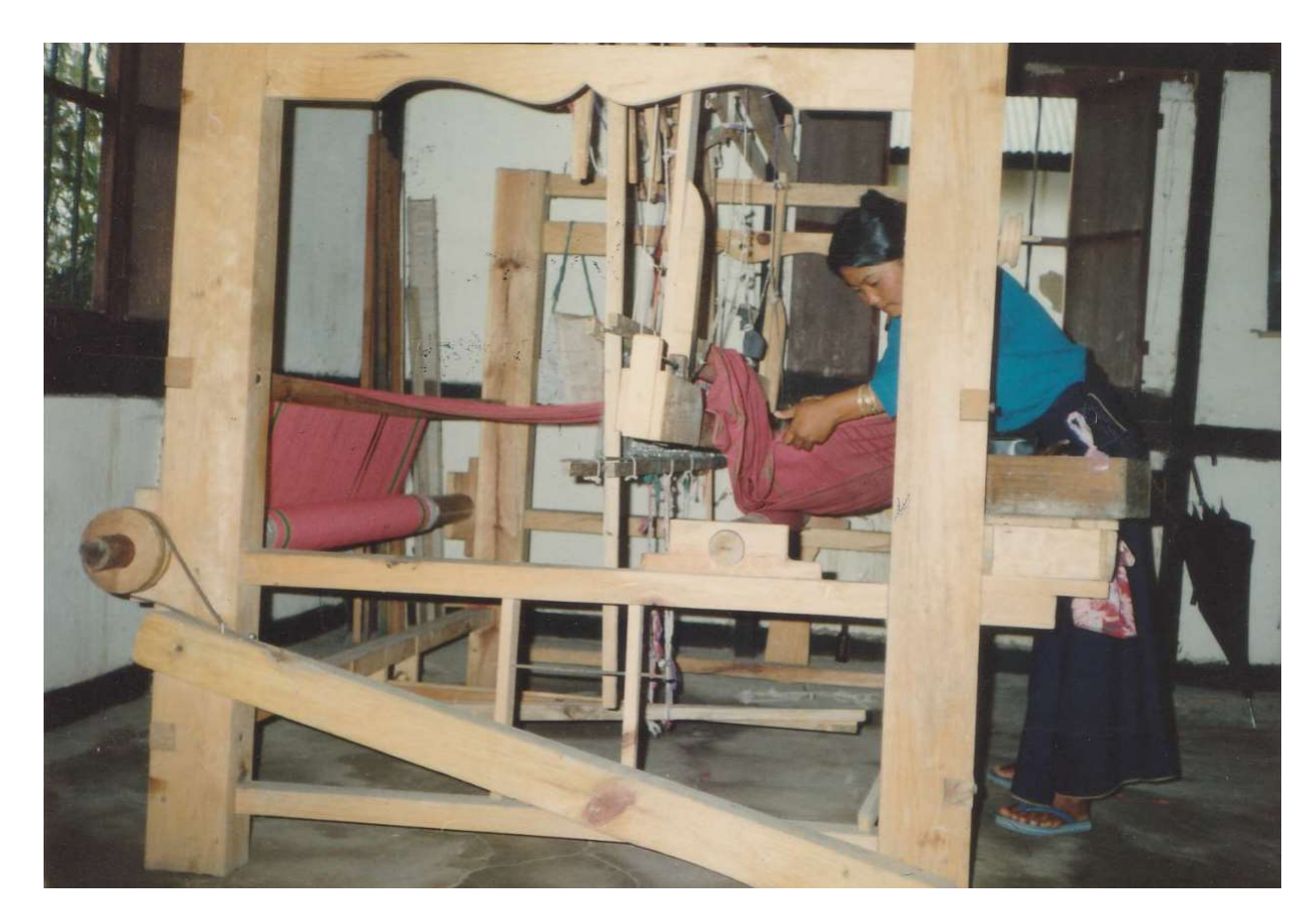
Figure 8 Village common handloom for production of cotton as well woolen shaws, lehengas, gamchhas are very popular in tribal areas of North East states. Generaqlly the village women comes and works for a few hours at her suitable time after catering to domestic duties and child care for some considerable income and livelihoods without being displaced from his home and family nand village residence.