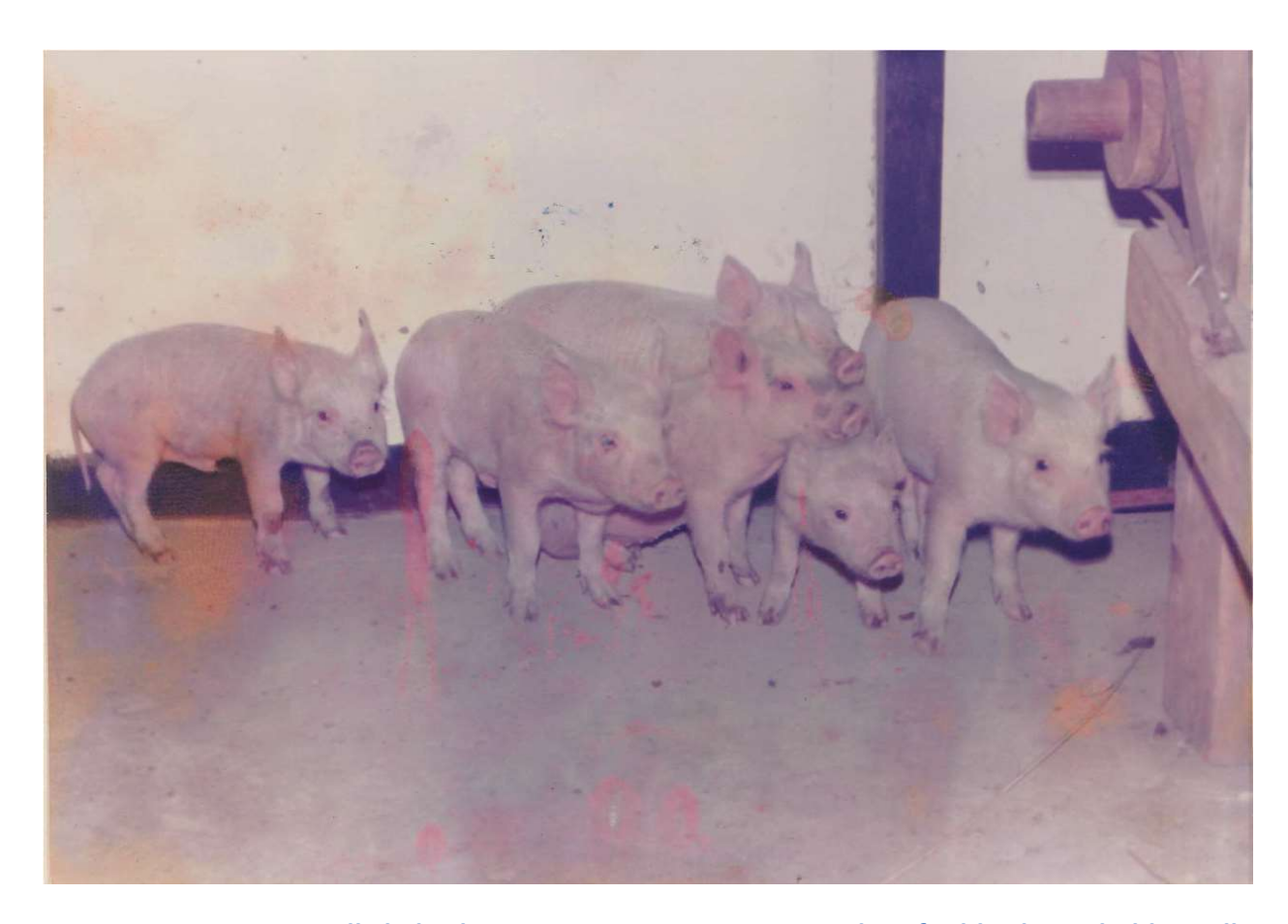
Figure 1 Piggery especially hybrid varieties, is an important and profitable household small enterprise especially i8n tribal and North East state as it can be stall fed in farmers own house and enclosure with reasonably well.