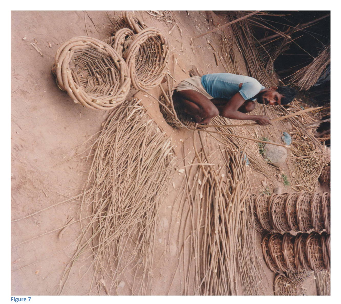
BASKET MAKING IN BALACHAUR WATERSHED UNDER NWDPRA PROGAMME.

Construction of free of cost channel system for water conveyance in field channel of canal/ WHS for higher water use efficiency with lower cost.